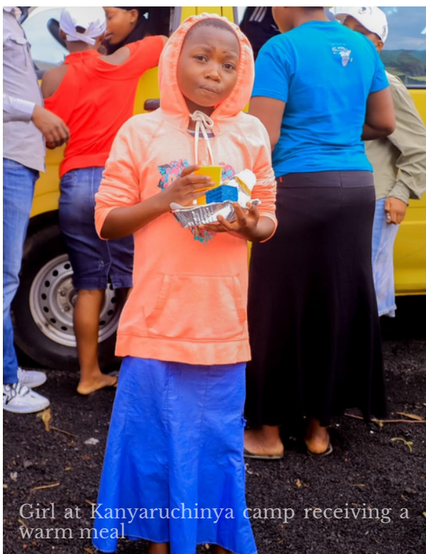
Girl at Kanyaruchinya camp receiving a warm meal

To everyone that supported our 555 Campaign, THANK YOU!