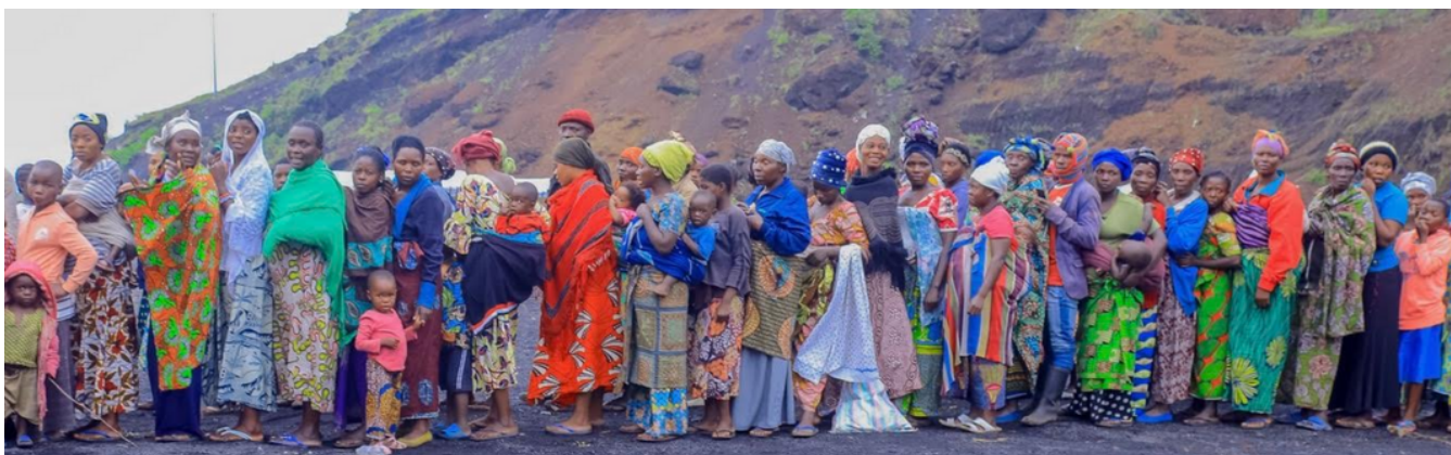
Mothers wait in line for food and livelihood distributions.