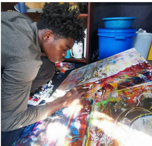
Art Student, GUAOA Orphanage

We're excited to bring you our first art gala event featuring art from GUAOA Orphanage and Buffalo, NY students!