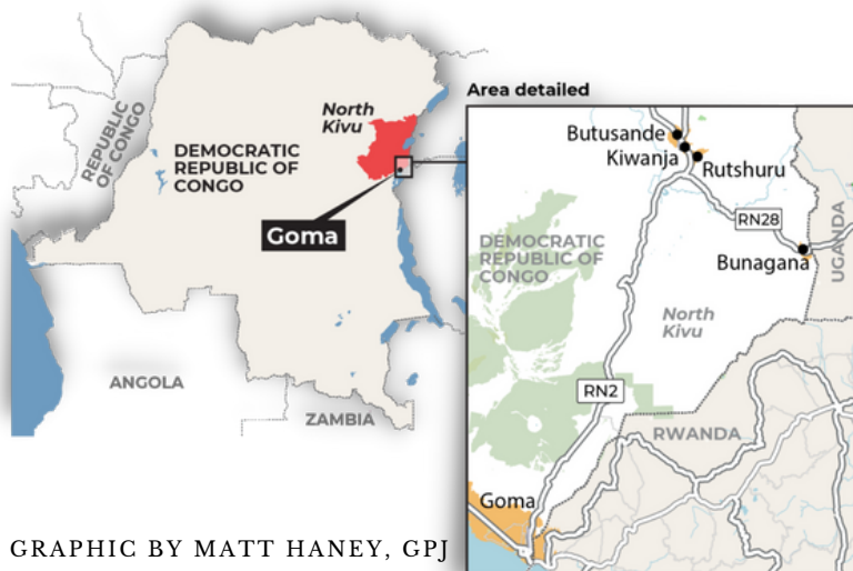
GRAPHIC BY MATT HANEY, GPJ

IMMEDIATE NEED FOR DRC ORPHANS' SAFETY & FOOD