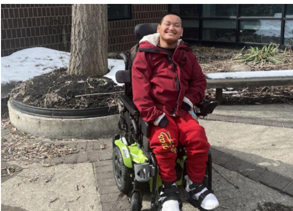
Students of BPS #84.