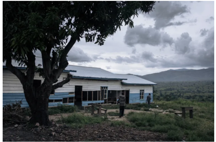
Two men inspect a school building used by M23 fighters as a military base in Kishishe, eastern Democratic Republic of the Congo, on April 5, 2023