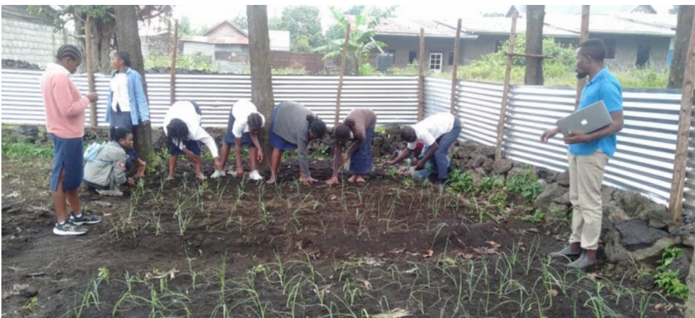
GUAOA children learning to grow vegetables from a volunteer