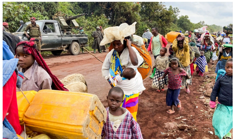
Displaced Congolese civilians carry their belongings near the border with Rwanda.

Learn more here: www.theguardian.com and www.bbcnews.com .