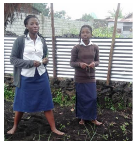
Left: Queen | Right: Chaneline