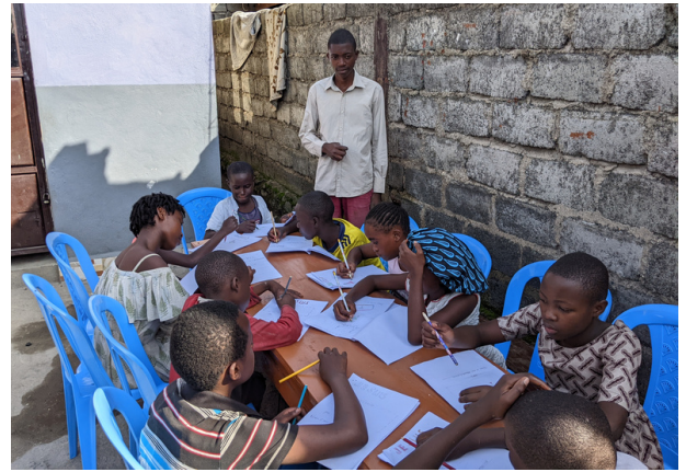
GUAOA orphanage children participating in the story exchange, writing and drawing about themselves.