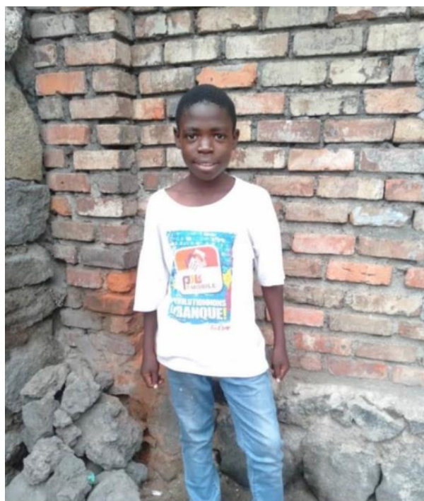
Faraja 5 th Grade Primary