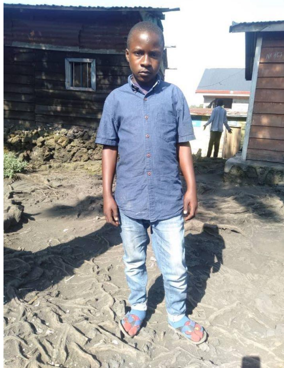
Dieumerici 1 st Grade Secondary